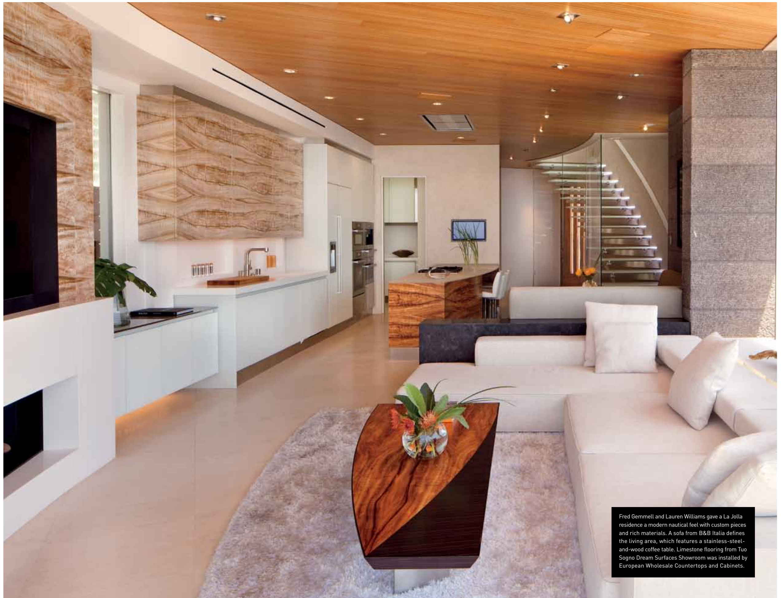
Fred Gemmell and Lauren Williams gave a La Jolla residence a modern nautical feel with custom pieces and rich materials. A sofa from B&B Italia defines the living area, which features a stainless-steel-and-wood coffee table. Limestone flooring from Tuo Sogno Dream Surfaces Showroom was installed by European Wholesale Countertops and Cabinets.

For the levels in between, the living spaces flow together on the main floor, while the master and a guest bedroom are upstairs. As the living area and master bedroom open completely to the elements with pocketing lift-and-slide doors, a cohesive indoor-outdoor palette was essential. As was finding a durable one. “We had to test every material because waves constantly