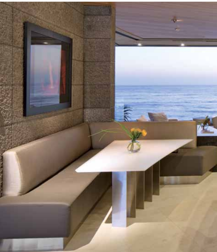
In the dining area, Matrix Design Studio created custom pieces including a corner banquette, fabricated by Ultimate Furniture Design, and a table made with a stainless-steel base and resin top from 3form. The photograph, Ghost , is by Peter Lik.