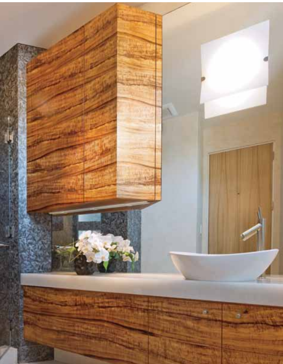
The house's rich textures carry through to a guest room bath, where a vanity and cabinet are highlighted with koa veneers. A Hansgrohe faucet pours into a Victoria + Albert sink, both from Ferguson Bath, Kitchen & Lighting Gallery.